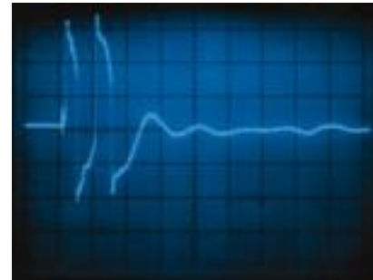
TYPICAL SURGE SUPPRESSOR OUTPUT

POWERVAR HAS AN ENVIABLE REPUTATION IN THE INDUSTRY AS AN INNOVATOR, A TECHNOLOGY LEADER AND AN EDUCATOR. TODAY, POWERVAR POWER CONDITIONING AND UNINTERRUPTIBLE POWER SUPPLY SYSTEMS ARE WIDELY USED IN SOPHISTICATED SEMICONDUCTOR FABRICATION PLANTS, CUSTOMER PREMISE TELECOMMUNICATIONS SYSTEMS, MEDICAL DIAGNOSTIC AND PATIENT TREATMENT SYSTEMS, AS WELL AS POINT-OF-SALE AND WIDE AREA RETAIL INFORMATION NETWORKS.